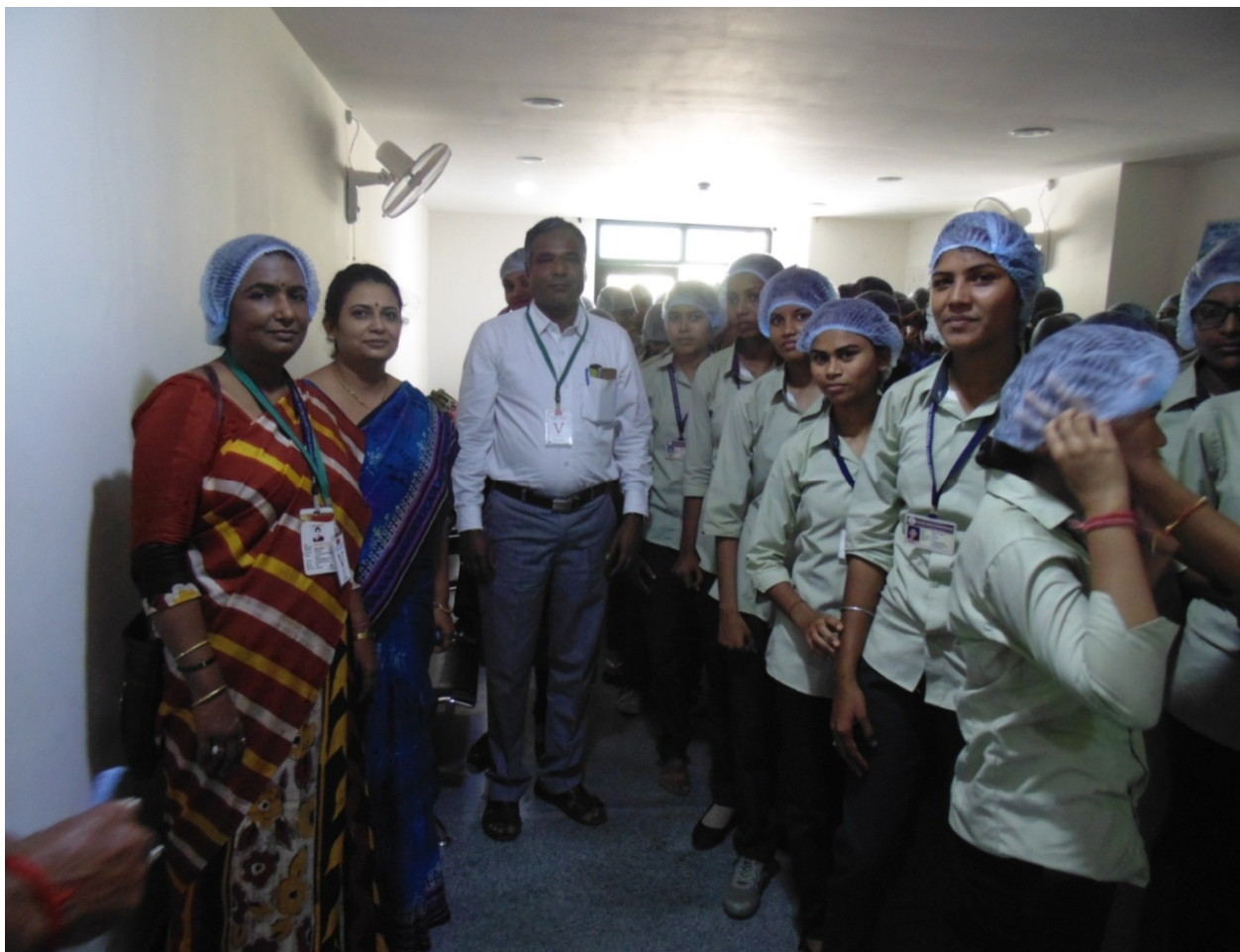
Teaching staff of Department of Microbiology along with Students of B. Sc.-II year (SEM III) Microbiology at Dinshaw's Ice cream factory, Butibori, Nagpur