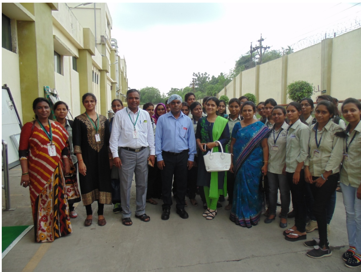
Production-Manager of Coco Cola Factory, Butibori, Nagpur along with Teaching staff and Students of B. Sc.-II year (Sem III) Microbiology in the premises of Coco Cola Factory