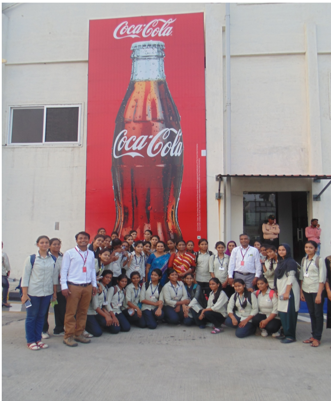
Visual Depiction of Complete Team of Teaching staff and Students of B. Sc.- II year (Sem III) Microbiology at Coco Cola Factory, Butibori, Nagpur