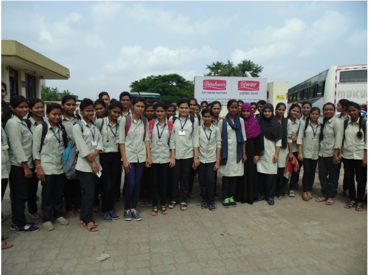
Students of B. Sc.-II year (Sem III) Microbiology assembled at the Dinshaw's Ice cream factory, Butibori, Nagpur