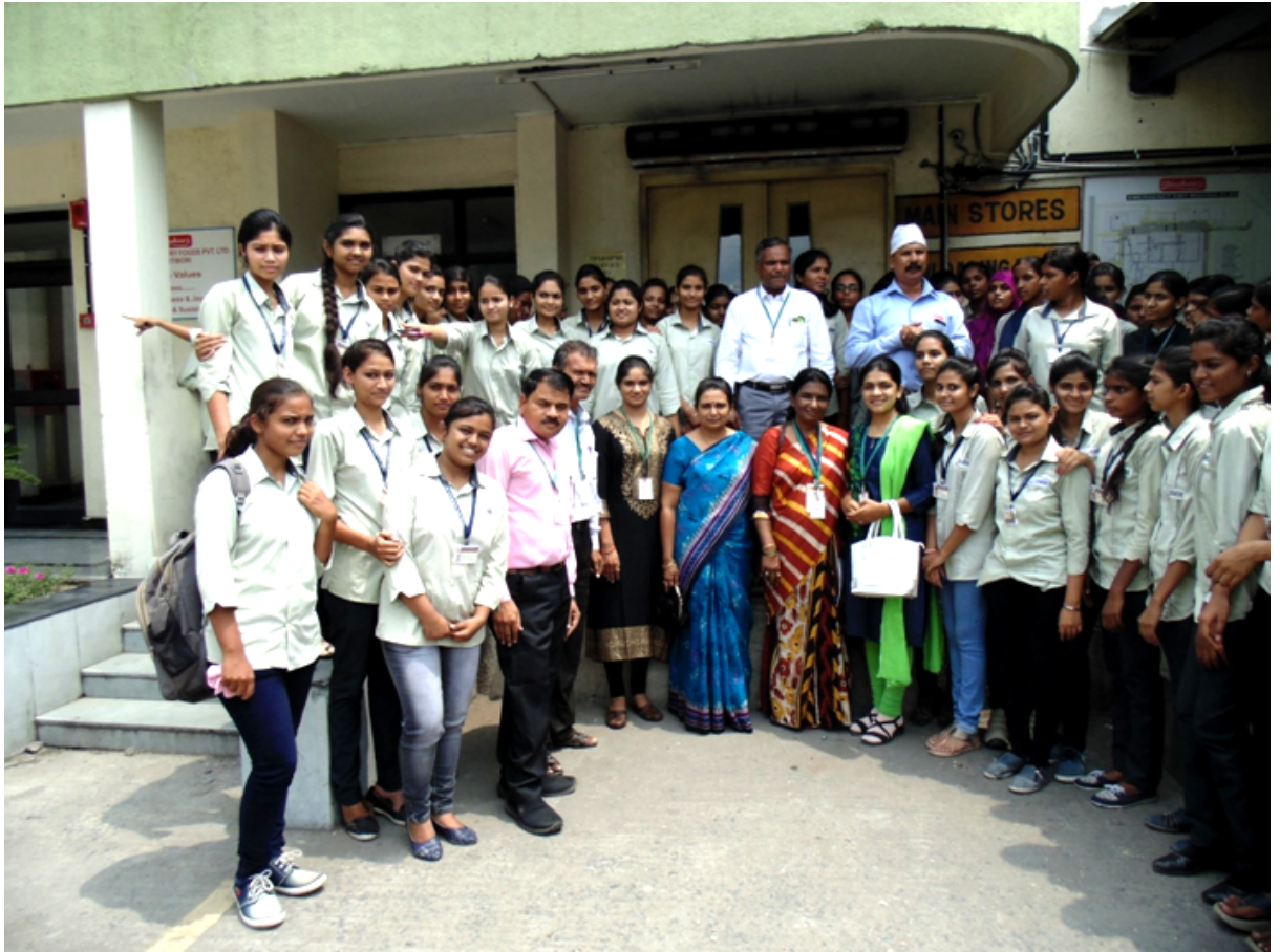
Teaching staff of Department of Microbiology and Manager of Dinshaw's Ice cream factory, Butibori, Nagpur along with Students of B. Sc.-II year (Sem III) Microbiology