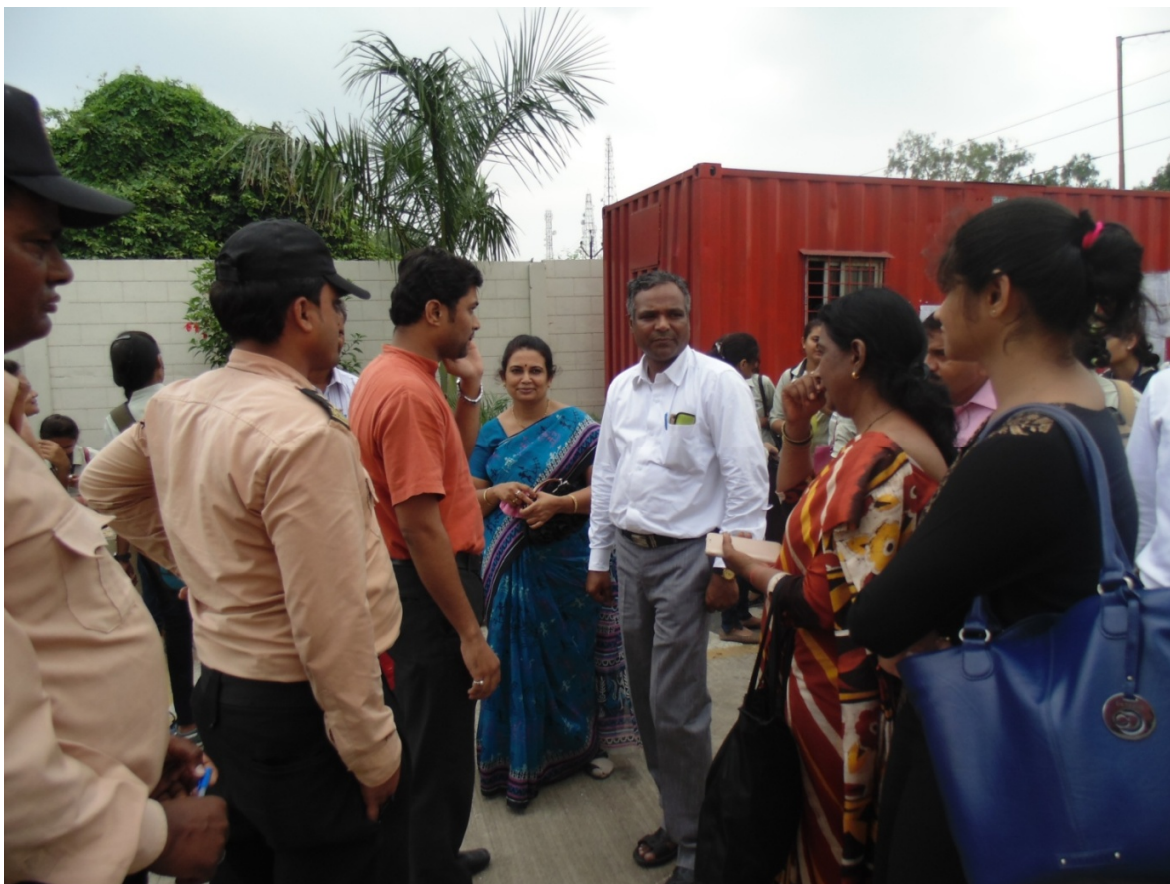
HR- Manager of Coco Cola Factory, Butibori, Nagpur instructing Teaching staff and Students of B. Sc.-II year (Sem III) Microbiology before taking entry in the Coco Cola Factory