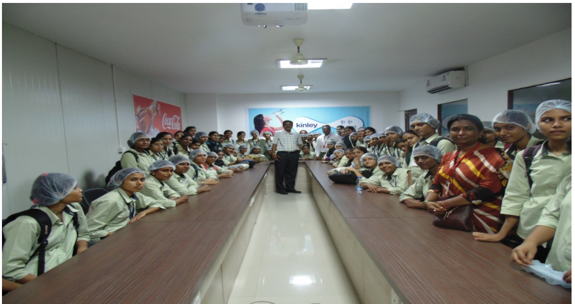
General Manager of Coco Cola Factory briefing Teaching staff and Students of B. Sc.-II year (Sem III) Microbiology in the conference room of Coco Cola Factory, Butibori, Nagpur